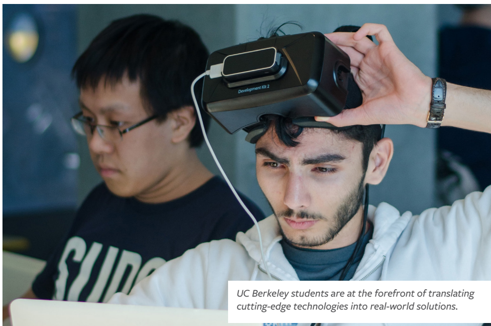
UC Berkeley students are at the forefront of translating cutting-edge technologies into real-world solutions.