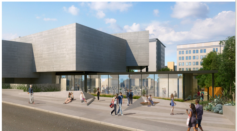
The future Bakar BioEginuity Hub at Woo Hon Fai Hall viewed from Bancroft Way.

The Bakar BioEginuity Hub will renew and transform a campus' landmark, the former Berkeley Art Museum and Pacific Film Archive, by transforming it into a full-service incubator. It will offer world-class wet laboratory, office and meeting space, where start-up teams can test, develop and grow their game-changing ideas one bench at a time. The reimagined space and its programs will pull together Berkeley's top researchers, students and the Bay Area community to accelerate the positive impact of cutting-edge research on our society and world. A single-story glass addition on Bancroft Way will bring the total square feet of flexible space to 40,000. Construction began in August 2019 and is scheduled to be complete in 2021.