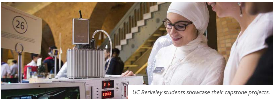
UC Berkeley students showcase their capstone projects.

At UC Berkeley innovators and entrepreneurs are creating groundbreaking products, revolutionary companies, and entirely new industries. The University plays a critical role in California's economy. Last year the campus expanded the dynamic ecosystem that fosters novel approaches to research and its translation into real-world applications. As of July 2022 UC Berkeley has: