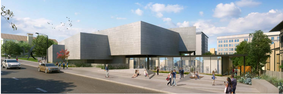
Rendering of the Bakar BioEngineering Hub at Woo Hon Fai Hall

The new Bakar BioEngineering Hub provides a home to Bakar Labs , an incubator serving startups from around the world and will cultivate the innovators of tomorrow with a vibrant set of entrepreneurship programs at the intersection of the life sciences with the physical, engineering, and data sciences.