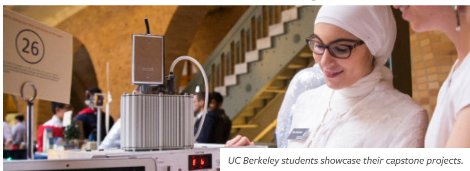
UC Berkeley students showcase their capstone projects.

At UC Berkeley innovators and entrepreneurs are creating groundbreaking products, revolutionary companies, and entirely new industries. The University plays a critical role in California's economy. Last year the campus expanded the dynamic ecosystem that fosters novel approaches to research and its translation into real-world applications. As of July 2021, UC Berkeley has: