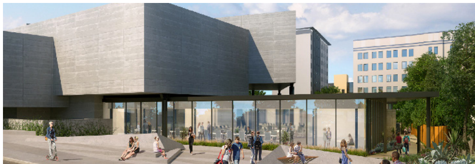
Rendering of the future Bakar BioEnginuity Hub at Woo Hon Fai Hall

Opening in late 2021, the Bakar BioEnginuity Hub will provide a home to Bakar Labs , an incubator serving startups from around the world and will cultivate the innovators of tomorrow with a vibrant set of entrepreneurship programs at the intersection of the life sciences with the physical, engineering, and data sciences.