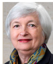
Treasury Secretary JANET YELLEN

Saul Perlmutter received the 2011 Nobel Prize in Physics. He led one of the two research teams that simultaneously discovered the accelerating expansion of the universe.