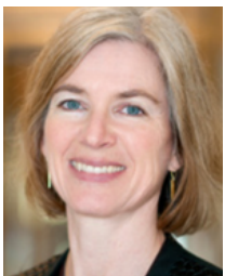
Nobel Laureate JENNIFER DOUDNA

Randy Schekman received the 2013 Nobel Prize in Physiology or Medicine for his role in revealing the machinery that regulates the transport and secretion of proteins in our cells.