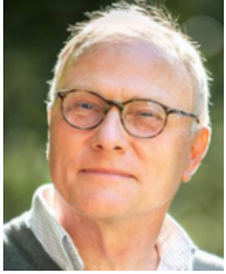
Nobel Laureate DAVID CARD

Berkeley faculty are leading the charge in many disciplines to make profound changes in the way we understand and interact with the world. Highlights include: