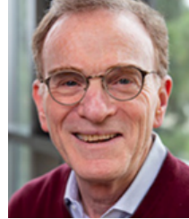
Nobel Laureate RANDY SCHEKMAN

David Card won the 2021 Nobel Prize in Economic Sciences for work that challenged orthodoxy and shifted our understanding of inequality and the social and economic forces that impact low-wage workers.