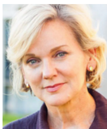
Energy Secretary JENNIFER GRANHOLM

2020 Nobel Laureate Jennifer Doudna is best known for her pioneering work on CRISPR/Cas9, a tool for editing genes that offers a potent new approach to understand and treat complex genetic diseases.